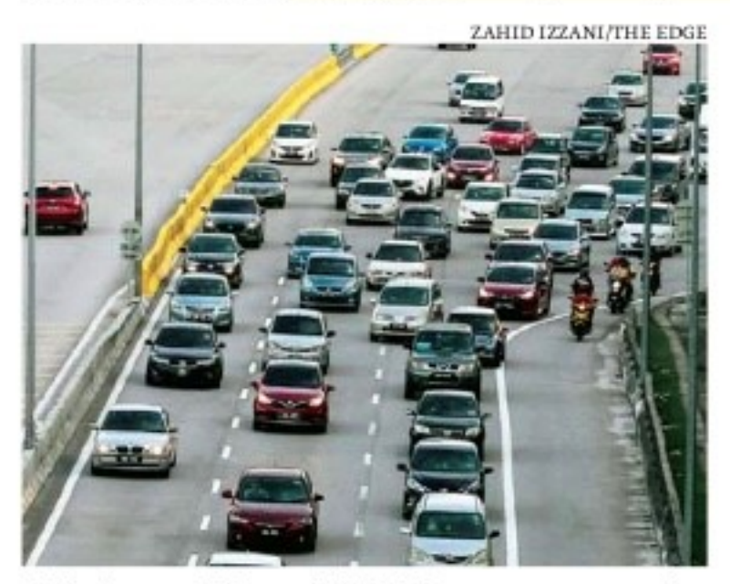
With the acquisition of UMW, Sime now commands over 50% of the domestic automotive market

DETAILS ADVISERS Best deal Sime Darby Bhd's acquisition of UMW CIMB Investment Bank (deal originator Holdings Bhd and principal adviser to Sime Darby); Maybank Investment Bank (principal adviser to UMW) for the mandatory takeover offer); AmInvestment Bank (independent adviser to Sime Darby's non-interested directors and shareholders); UBS (financial adviser to Permodalan Nasional) Notable mention Sarawak's acquisition of a substantial Affin Hwang Investment Bank (financial stake in Affin Bank Bhd from the Armed adviser to LTAT and Boustead); Forces Fund Board (LTAT) and Boustead AmInvestment Bank (adviser to Holdings Bhd Sarawak)